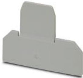
Partition plate, Length: 75 mm, Width: 2.5 mm, Height: 67 mm, Color: gray

Please be informed that the data shown in this PDF Document is generated from our Online Catalog. Please find the complete data in the user's documentation. Our General Terms of Use for Downloads are valid ( http://phoenixcontact.com/download )