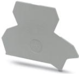
End cover, length: 72 mm, width: 1.5 mm, height: 59 mm, color: gray

Please be informed that the data shown in this PDF Document is generated from our Online Catalog. Please find the complete data in the user's documentation. Our General Terms of Use for Downloads are valid ( http://phoenixcontact.com/download )