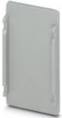
Separating plate, color: gray

Please be informed that the data shown in this PDF Document is generated from our Online Catalog. Please find the complete data in the user's documentation. Our General Terms of Use for Downloads are valid ( http://phoenixcontact.com/download )