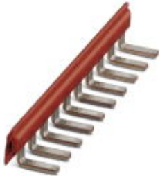
Insertion bridge, pitch: 6.2 mm, number of positions: 80, color: red

Please be informed that the data shown in this PDF Document is generated from our Online Catalog. Please find the complete data in the user's documentation. Our General Terms of Use for Downloads are valid ( http://phoenixcontact.com/download )