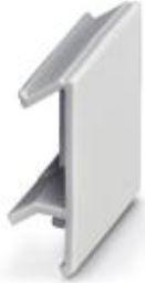
Filler plug for unoccupied terminal points, color: Light gray

Please be informed that the data shown in this PDF Document is generated from our Online Catalog. Please find the complete data in the user's documentation. Our General Terms of Use for Downloads are valid ( http://phoenixcontact.com/download )