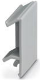
Filler plug for unoccupied terminal points, color: Light gray

Please be informed that the data shown in this PDF Document is generated from our Online Catalog. Please find the complete data in the user's documentation. Our General Terms of Use for Downloads are valid ( http://phoenixcontact.com/download )