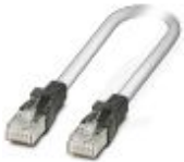
Patch cable, CAT5, assembled, 5 m

Patch cable - FL CAT5 PATCH 5,0 - 2832580