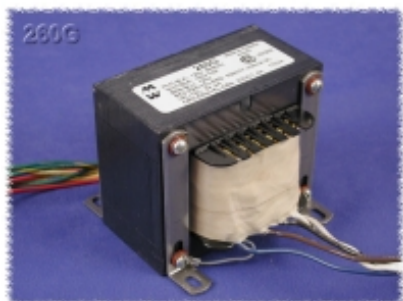
Plate & Filament 260 Series Universal Primary & 50/60 Hz. Operation