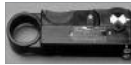
2-Step Cable Stripper with adjustable replacement blades for standard & Teflon RG-59, RG-6 & Belden 8281.