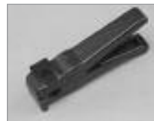
2-Step Cable Stripper with adjustable replacement blades for RG-6, 58, 59 & 62. Poly bagged.