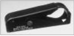
2-Step Cable Stripper with self-adjusting replacement blades for RG-6, 58, 59 & 62.