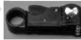
3-Step Cable Stripper with non-adjustable replacement blades RG-8, 11 & 213.