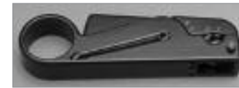
2-Step Cable Stripper with non-adjustable replacement blades RG-8, 11 & 213.