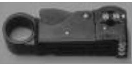
3-Step Cable Stripper with adjustable replacement blades for standard & Teflon RG-58, 59 & 62.