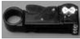
3-Step Cable Stripper with adjustable replacement blades for standard & Teflon RG-59, RG-6 & Belden 8281.