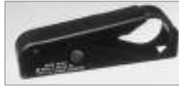
3-Step Cable Stripper with self-adjusting replacement blades for RG-6, 58, 59 & 62.