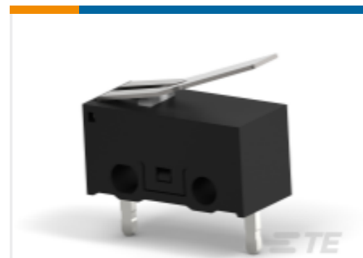
TE Model / Part # 2351447-5 UMINSA SW BLV0.88N 3A /1.5A AC NC PCB