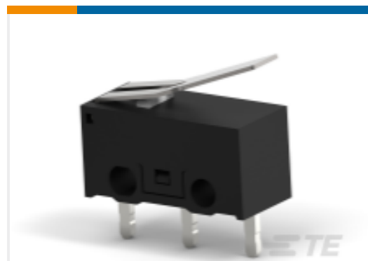
TE Model / Part # 2351447-4 UMINSA SW BLV0.88N 3A /1.5A AC SC PCB