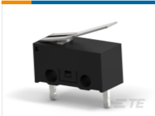
TE Model / Part # 2351447-5 UMINSA SW BLV0.88N 3A /1.5A AC NC PCB