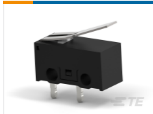
TE Model / Part # 2351447-6 UMINSA SW BLV0.88N 3A /1.5A AC NO PCB