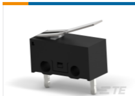
TE Model / Part # 2351447-2 UMINSA SW BLEV 0.74N 0.1A/30VDC NC PCB