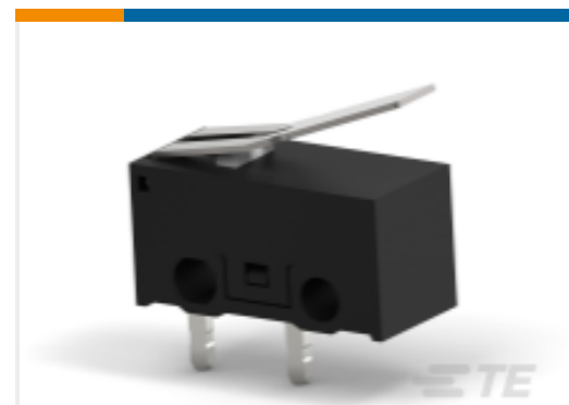
TE Model / Part # 2351447-3 UMINSA SW BLEV 0.74N 0.1A/30VDC NO PCB