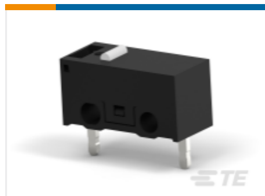
TE Model / Part # 2351444-5 UMINSA SW PPLUN 0.88N 3A/1.5A AC NC PCB