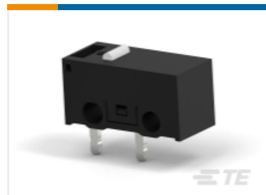
TE Model / Part # 2351444-6 UMINSA SW PPLUN 0.88N 3A/1.5A AC NO PCB