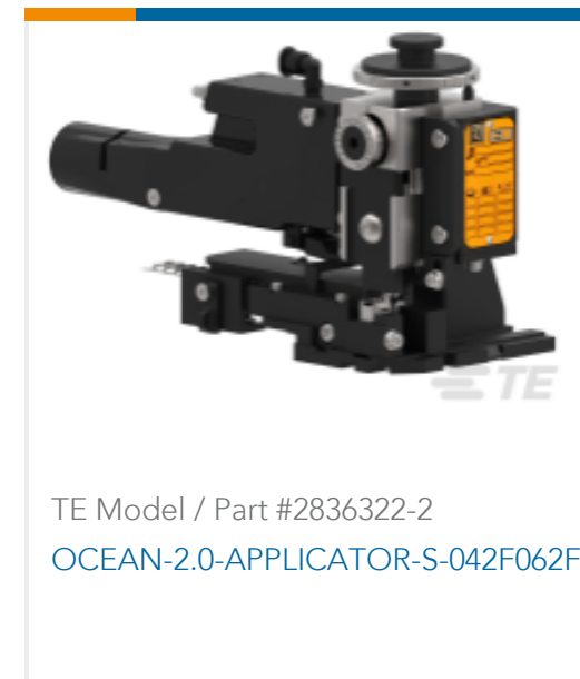
TE Model / Part #2836322-2 OCEAN-2.0-APPLICATOR-S-042F062F