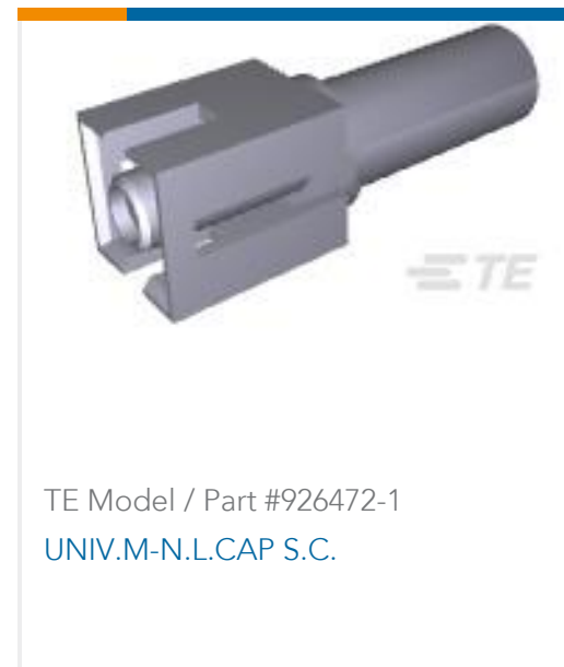
TE Model / Part #926472-1 UNIV.M-N.L.CAP S.C.