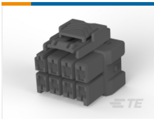
TE Part #8-2232265-3 POWER TRIPLE LOCK GLOW WIRE PLUG