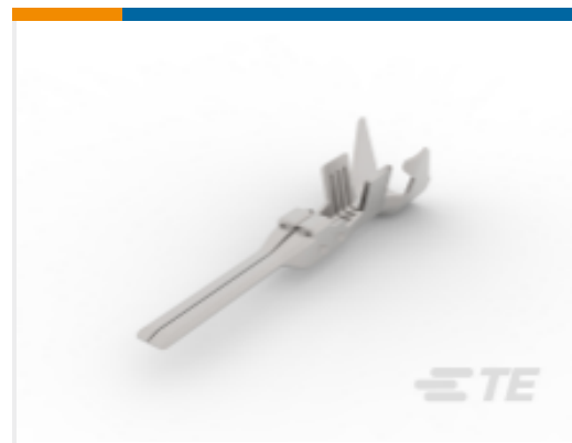
TE Part #2329907-1 Power Versa-Lock SEAL TAB, 14-16 AWG