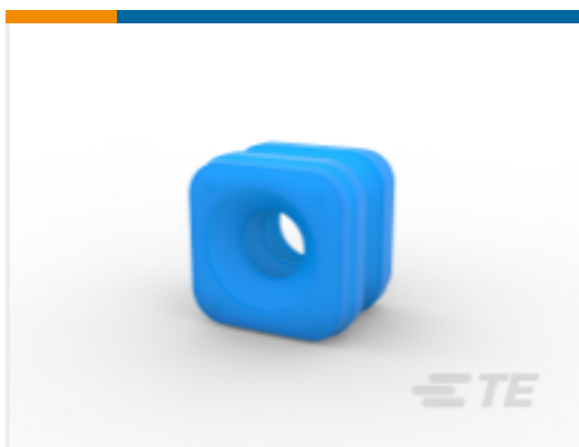
TE Part #2325349-1 Power Versa-Lock REAR SEAL, 1X1, LargeID