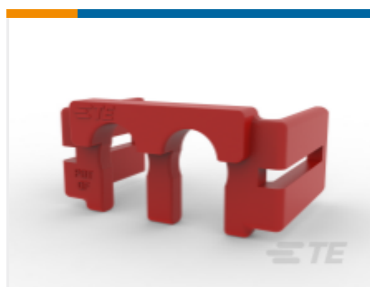
TE Part #2334614-2 Power Versa-Lock BACK COVER 2P