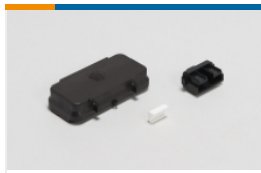
Rectangular Caps & Covers(3)