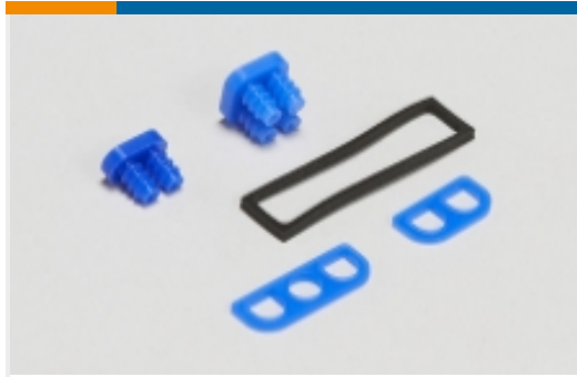
Rectangular Connector Seals(6)