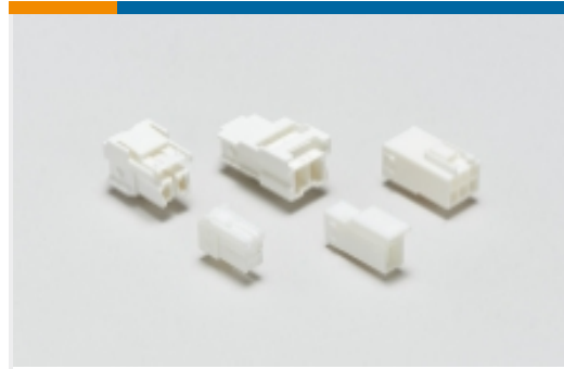
Rectangular Power Connectors(33)