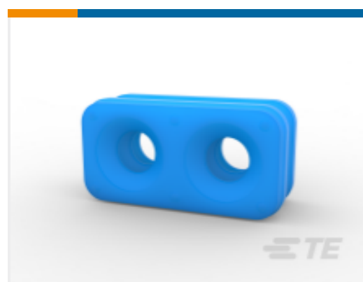
TE Part #2325349-2 Power Versa-Lock REAR SEAL, 1X2, LargeID