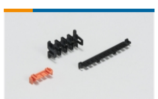
Rectangular Connector Locking(1)