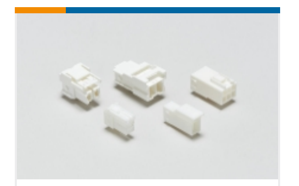
Rectangular Power Connectors(33)