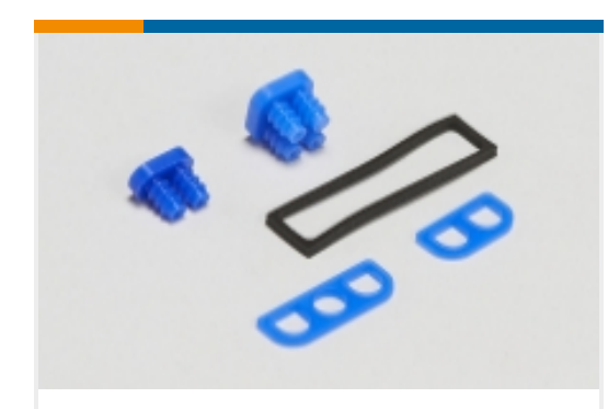
Rectangular Connector Seals(6)