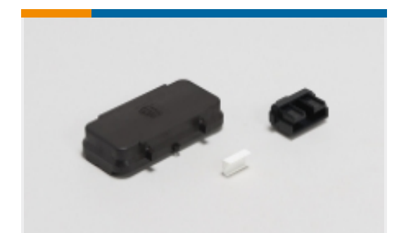
Rectangular Caps & Covers(3)