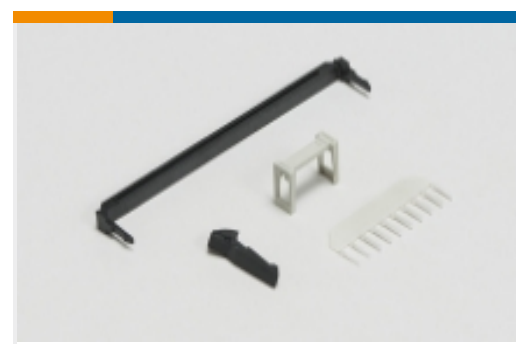
Ribbon Connector Accessories(1)