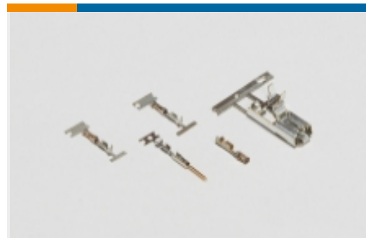
Wire-to-Board Connector Contacts(27)