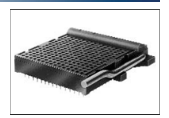
NOTE: Aries specializes in custom design and production. In addition to the standard products shown on this page, special materials, platings, sizes, and configurations can be furnished, depending on quantities. Aries reserves the right to change product specifications without notice.

See Data Sheet No. 10005 for additional information