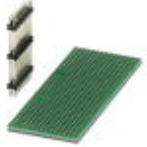
Perfboard with HBUS connection incl. suitable pin strip

Electronic housing - RPI-BC EXT-PCB HBUS SET - 2202995