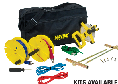
KITS AVAILABLE SHOWN: CATALOG #2135.35