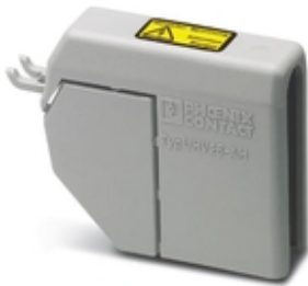
Covering hood, length: 75.9 mm, width: 22.8 mm, height: 53.2 mm, color: gray

Please be informed that the data shown in this PDF Document is generated from our Online Catalog. Please find the complete data in the user's documentation. Our General Terms of Use for Downloads are valid ( http://phoenixcontact.com/download )