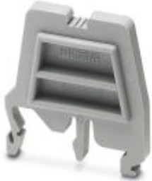
Flange cover, Length: 43.3 mm, Width: 5.2 mm, Color: gray

Please be informed that the data shown in this PDF Document is generated from our Online Catalog. Please find the complete data in the user's documentation. Our General Terms of Use for Downloads are valid ( http://phoenixcontact.com/download )