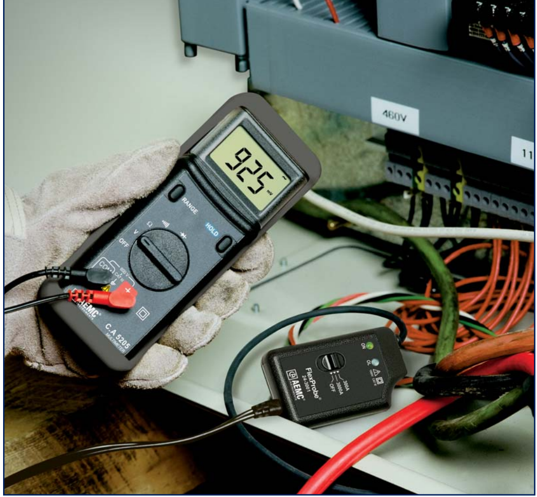
FlexProbe® conveniently plugs into the standard DMM voltage input for direct read-out of the measured current.