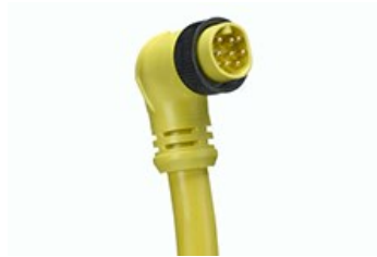
Series image - Reference only

Status: Active Series: 130007 Category: Molex Parts Engineering/Old PN: 208003A01F060