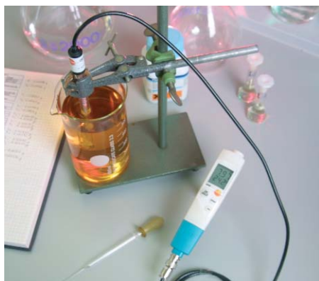
testo 206-pH3 facilitates the connection of external pH probes