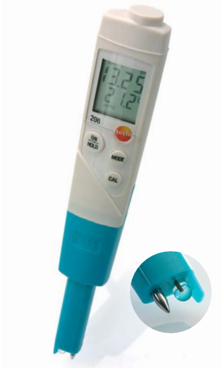
pH1 probe head for liquids