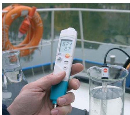
Automatic temperature compensation in external probes with temperature sensor