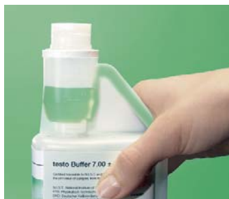
pH buffer solution in the storage bottle with dosing container