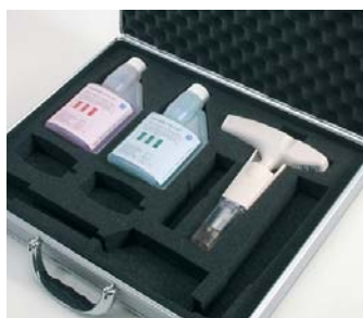
Set case with testo 205, pH 4.0 and 7.0 buffers as well as storage cap