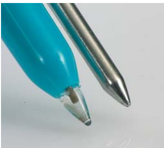
pH2 probe head for semi-solid substances

Together with experts from trade and industry, Testo has developed innovative instruments that resolve these problems.