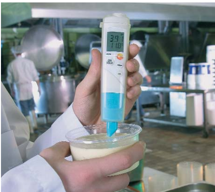
testo 206-pH2 is ideal for measurements in viscoplastic substances.