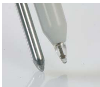
pH tip embedded in break-proof plastic