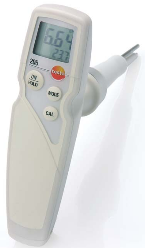
Robust food penetration pH/°C meter with automatic temperature compensation