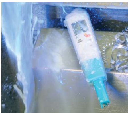
The "TopSafe" case protects in tough industrial conditions