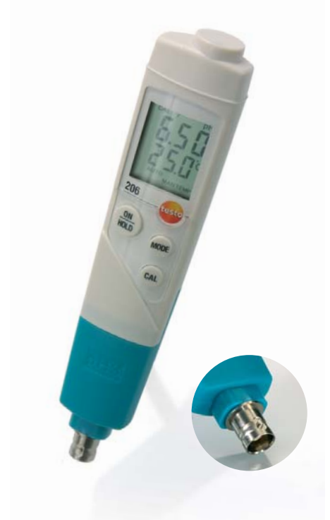
pH3 probe head with BNC interface