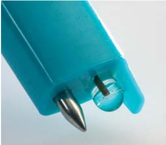
pH1 probe head for liquids

Measurement of the pH value plays an important role in many areas. Anywhere where there are chemical and biochemical reactions, the pH value has an important indicator function.