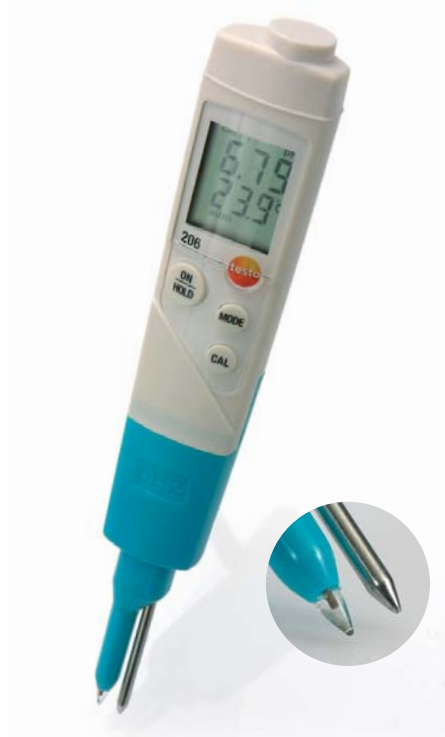
pH2 probe head for semi-solid materials