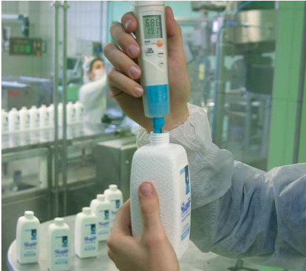
Automatic full scale value recognition and clear 2 line display.