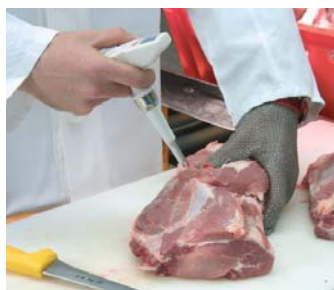
Fast and convenient measurement during production