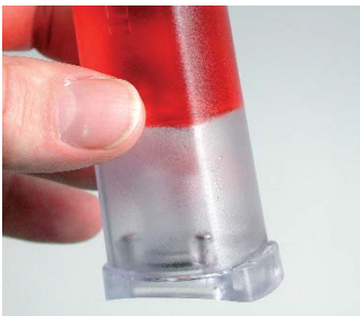
The potassium chloride solution bonded in the gel cannot leak

Due to the large volume of gel electrolyte and the hole diaphragm, Testo pH probes are not only leakproof, they are almost completely maintenance-free, robust and unaffected by dirt and dust.