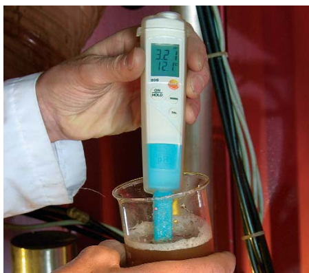
testo 206-pH1 is ideal for measurements in liquids