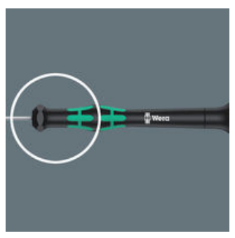
The precision zone directly above the blade gives the user a better feel for the right rotation angle during fine adjustment work.