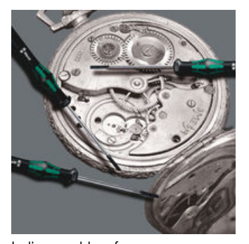
Indispensable for many users, including electronics technicians, opticians, precision engineers, jewellers, EDP hardware fitters and model-makers.