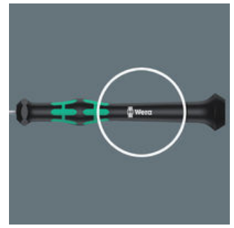
The fast-turning zone just below the rotating cap allows rapid twisting.