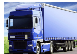
Service, Maintenance & Calibration