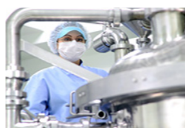
Laboratories & Clean Rooms