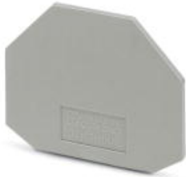
End cover, Length: 54 mm, Width: 2.3 mm, Color: gray

Please be informed that the data shown in this PDF Document is generated from our Online Catalog. Please find the complete data in the user's documentation. Our General Terms of Use for Downloads are valid ( http://phoenixcontact.com/download )