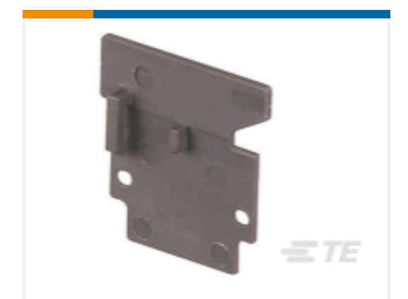
TE Model / Part # 1SNK900101R0000 CS