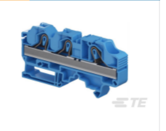
TE Model / Part # 1SNK710020R0000 ZK10-BL