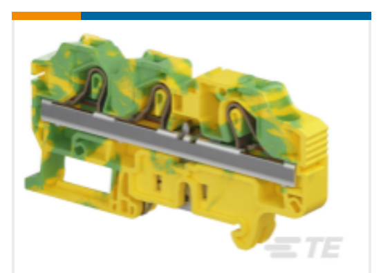
TE Model / Part # 1SNK710151R0000 ZK10-PE-3P