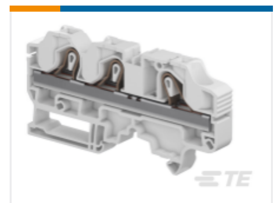
TE Model / Part # 1SNK710011R0000 ZK10-3P