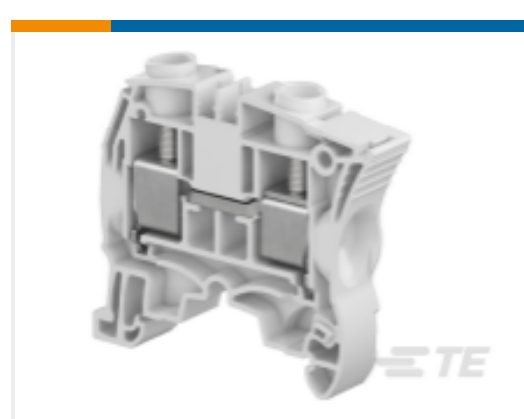
TE Model / Part # 1SNK510010R0000 ZS16