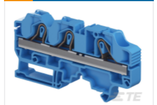
TE Model / Part # 1SNK710021R0000 ZK10-3P-BL