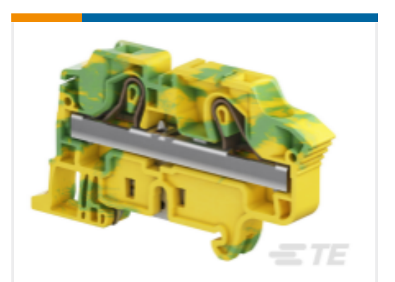
TE Model / Part # 1SNK710150R0000 ZK10-PE