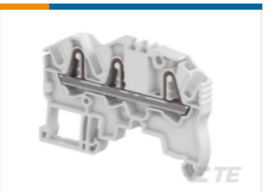
TE Model / Part # 1SNK705011R0000 ZK2.5-3P