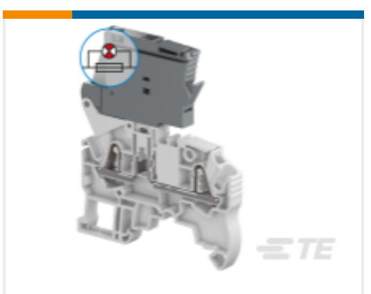
TE Model / Part # 1SNK706411R0000 ZK2.5-SF-R1