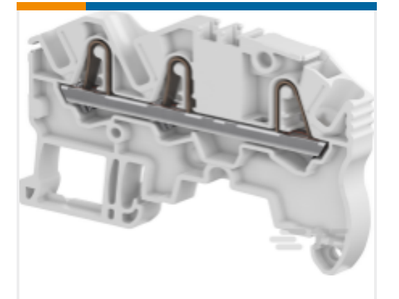
TE Model / Part # 1SNK705073R0000 ZK2.5-3P-BK