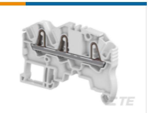
TE Model / Part # 1SNK705031R0000 ZK2.5-3P-OR