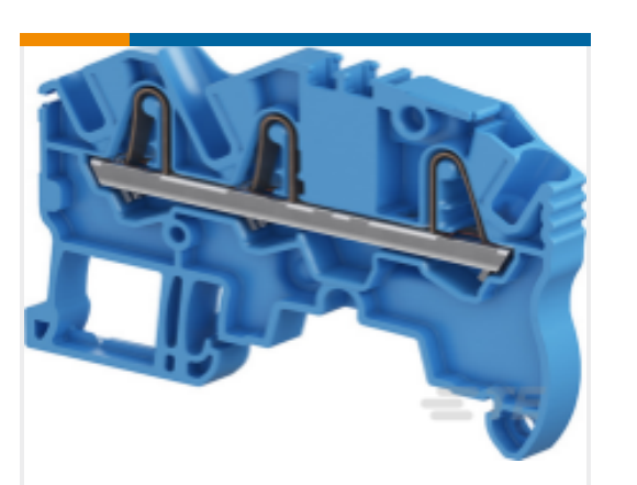
TE Model / Part # 1SNK705021R0000 ZK2.5-3P-BL