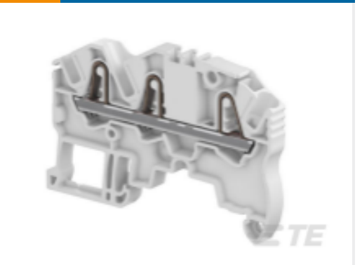
TE Model / Part # 1SNK705068R0000 ZK2.5-3P-GN