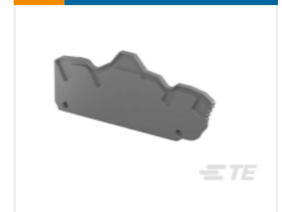
TE Model / Part #1SNK705912R0000 EK2.5-4P