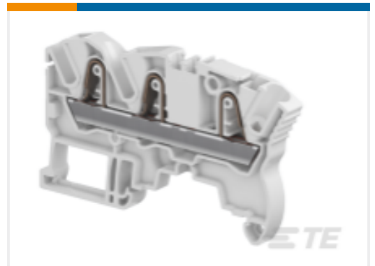
TE Model / Part # 1SNK706031R0000 ZK4-3P-OR