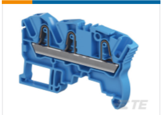
TE Model / Part # 1SNK706021R0000 ZK4-3P-BL