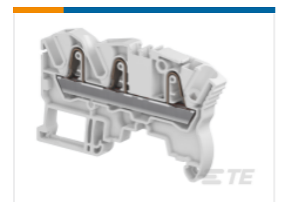
TE Model / Part # 1SNK706011R0000 ZK4-3P