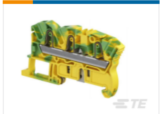
TE Model / Part # 1SNK706151R0000 ZK4-PE-3P