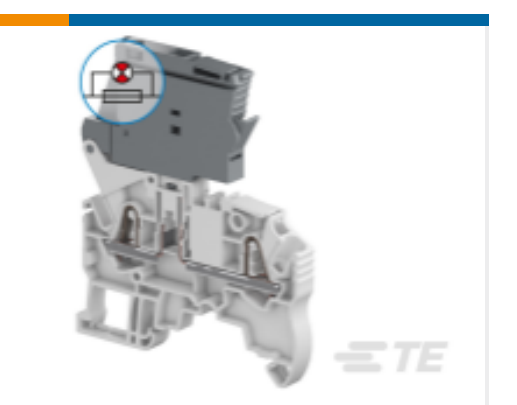
TE Model / Part # 1SNK706412R0000 ZK2.5-SF-R3