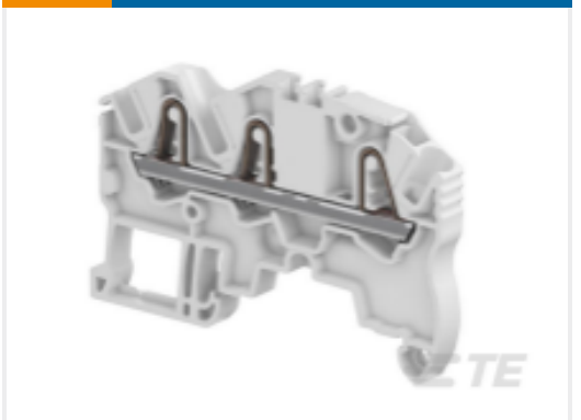
TE Model / Part # 1SNK705069R0000 ZK2.5-3P-RD