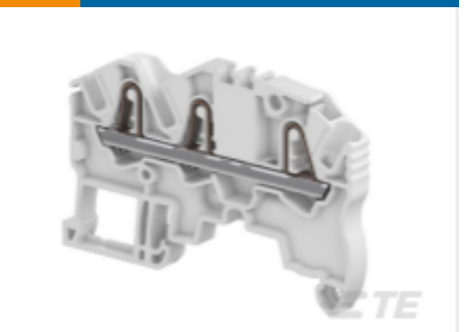
TE Model / Part # 1SNK705067R0000 ZK2.5-3P-YL