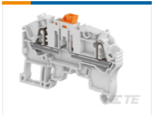
TE Model / Part # 1SNK705330R0000 ZK2.5-S-OR