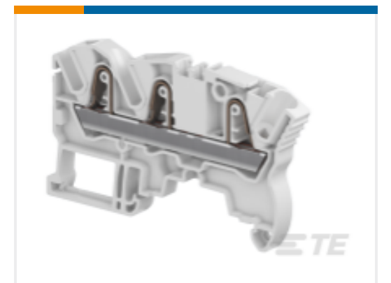
TE Model / Part #1SNK706011R0000 ZK4-3P