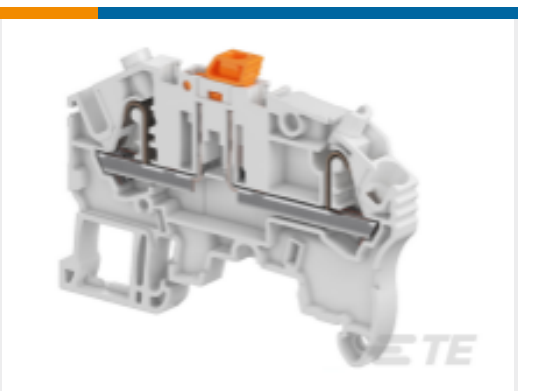
TE Model / Part # 1SNK705320R0000 ZK2.5-S-BL