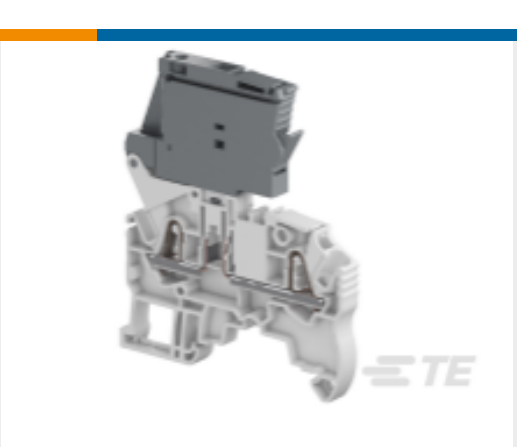
TE Model / Part #1SNK706410R0000 ZK2.5-SF