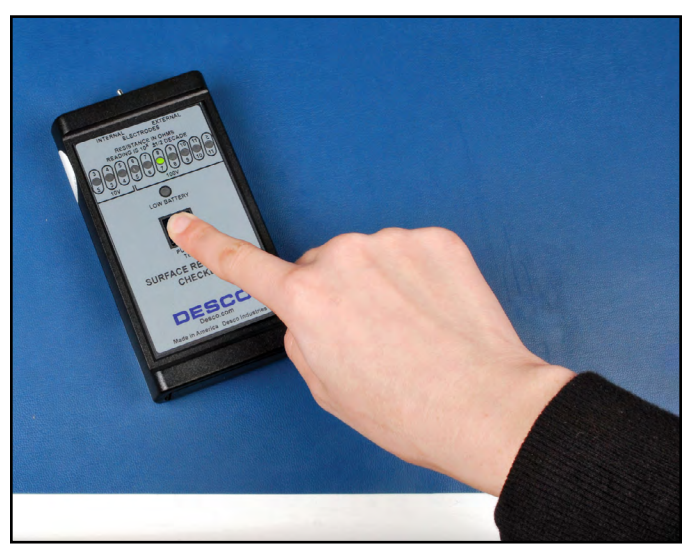
Figure 3. Using the parallel electrodes to measure surface resistance

If the measurement is outside acceptable limits, clean the surface with an ESD cleaner containing no insulative silicone such as Desco <u>10435</u> Reztore® Surface & Mat Cleaner, and re-test to determine if the cause of failure is an insulative dirt layer or the ESD worksurface material.