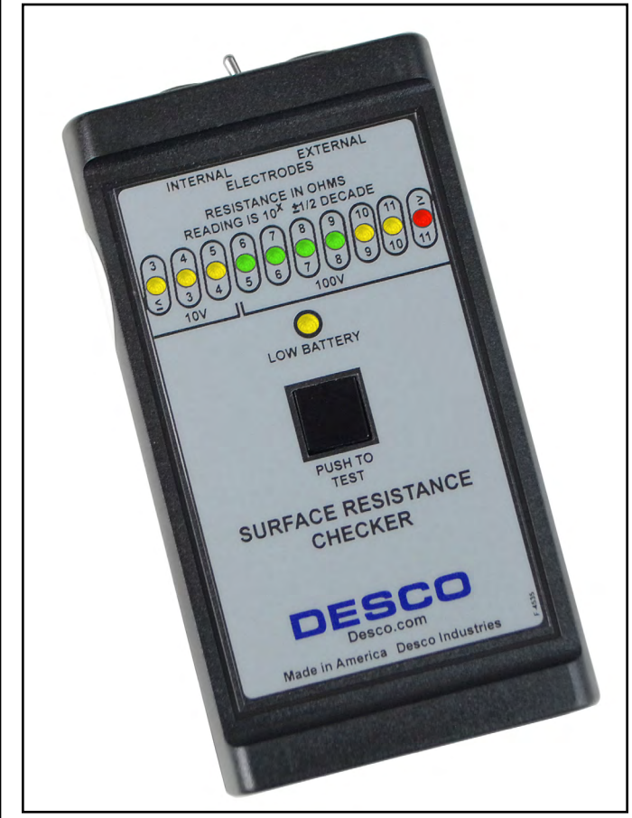
Figure 1. Desco <u>19640</u> Surface Resistance Checker