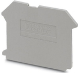
End cover, length: 50 mm, width: 2 mm, height: 36 mm, color: gray

Please be informed that the data shown in this PDF Document is generated from our Online Catalog. Please find the complete data in the user's documentation. Our General Terms of Use for Downloads are valid ( http://phoenixcontact.com/download )