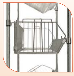
Flat Provides maximum space efficiency