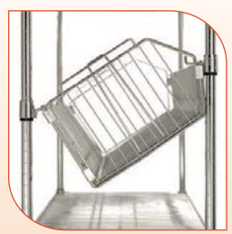
Angled Up Provides maximum bin capacity