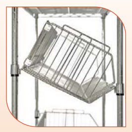
Angle Down Flows parts to front provides maximum accessibility