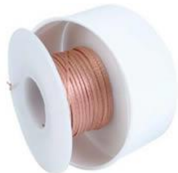
1825-5F No-Clean Red #6 Braid - AS 5' 25 units/case