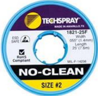
1821-25F No-Clean Yellow #2 Braid - AS 25' 1 units/case