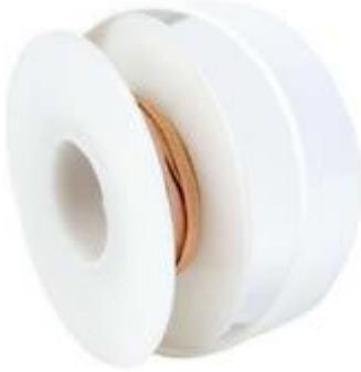
1821-25F No-Clean Yellow #2 Braid - AS 25' 1 units/case