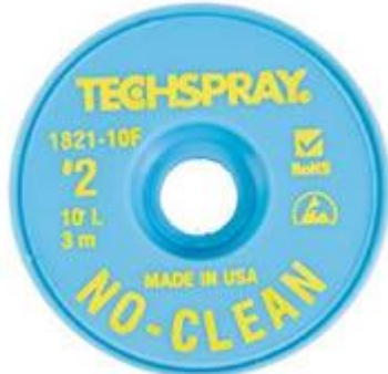
1821-10F No-Clean Yellow #2 Braid - AS 10' 25 units/case