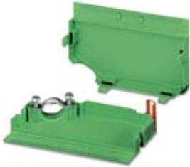
Cable housing, Pitch: 0 mm, Number of positions: 19, Dimension a: 95 mm, Color: green

Please be informed that the data shown in this PDF Document is generated from our Online Catalog. Please find the complete data in the user's documentation. Our General Terms of Use for Downloads are valid ( http://phoenixcontact.com/download )