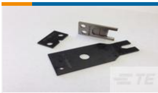
TE Part #690474-5 SHEAR BLADE