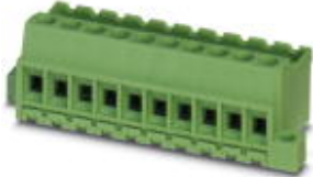
The figure shows a 10-position version of the product

Plug component, Nominal current: 12 A, Rated voltage (III/2): 320 V, Number of positions: 7, Pitch: 5.08 mm, Connection method: Screw connection with tension sleeve, Color: green, Contact surface: Tin, Mounting: Direct mounting