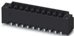
The figure shows a 10-pos. version with 20 contacts

PCB headers, nominal current: 8 A, number of positions: 2, pitch: 3.5 mm, color: black, contact surface: Tin, mounting: THR soldering