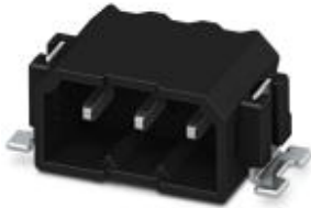
The figure shows the 3-pos. version

PCB headers, nominal current: 6 A, number of positions: 2, pitch: 2.5 mm, color: black, contact surface: Tin, mounting: SMD soldering, Article with anti-rotation pin