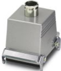
Coupling housing, with double locking latch, height 82 mm, with screw connection, 1x Pg29

Please be informed that the data shown in this PDF Document is generated from our Online Catalog. Please find the complete data in the user's documentation. Our General Terms of Use for Downloads are valid ( http://phoenixcontact.com/download )