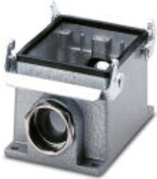
Box mounting base, with double locking latch, height 72 mm, with screw connection, 1x Pg29

Please be informed that the data shown in this PDF Document is generated from our Online Catalog. Please find the complete data in the user's documentation. Our General Terms of Use for Downloads are valid ( http://phoenixcontact.com/download )