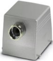
Sleeve housing, for double locking latch, height 80 mm, with screw connection, 1x Pg21, lateral cable entry

Please be informed that the data shown in this PDF Document is generated from our Online Catalog. Please find the complete data in the user's documentation. Our General Terms of Use for Downloads are valid ( http://phoenixcontact.com/download )