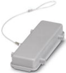
HEAVYCON protective cover, series B24, for supporting base element with double locking latch, with retaining cord, IP54, PA

Please be informed that the data shown in this PDF Document is generated from our Online Catalog. Please find the complete data in the user's documentation. Our General Terms of Use for Downloads are valid ( http://phoenixcontact.com/download )