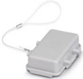
HEAVYCON protective cover, series B10, for supporting base element with double locking latch, with retaining cord, IP54, PA

Please be informed that the data shown in this PDF Document is generated from our Online Catalog. Please find the complete data in the user's documentation. Our General Terms of Use for Downloads are valid ( http://phoenixcontact.com/download )