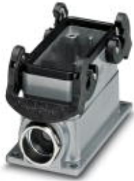
Box mounting base, with double locking latch, height 67 mm, with screw connection, 1x Pg21

Please be informed that the data shown in this PDF Document is generated from our Online Catalog. Please find the complete data in the user's documentation. Our General Terms of Use for Downloads are valid ( http://phoenixcontact.com/download )