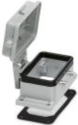
HEAVYCON B10 panel mounting base, for double locking latch, height: 29 mm, with plastic cover, with flat gasket

Please be informed that the data shown in this PDF Document is generated from our Online Catalog. Please find the complete data in the user's documentation. Our General Terms of Use for Downloads are valid ( http://phoenixcontact.com/download )