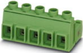
The figure shows the 5-pos. version

PCB connector, nominal current: 16 A, number of positions: 12, pitch: 7.62 mm, connection method: Screw connection with tension sleeve, color: green, contact surface: Tin