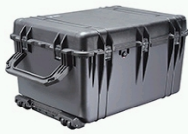
1660 Protector Case Large Case