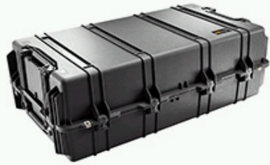
1780 Protector Case Transport Case