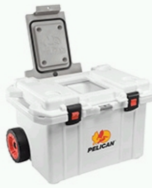
55QT Cooler Wheeled Cooler