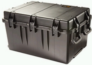
iM3075 Storm Case Transport Case