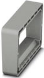
Spacer plate for PLW 16-6/5 feed-through terminal block

Please be informed that the data shown in this PDF Document is generated from our Online Catalog. Please find the complete data in the user's documentation. Our General Terms of Use for Downloads are valid ( http://phoenixcontact.com/download )