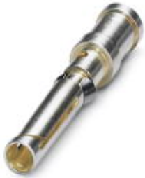
Turned 1.6 crimp contact, individual female contact, core diameter 0.14 to 0.37 mm 2 , silver-plated

Please be informed that the data shown in this PDF Document is generated from our Online Catalog. Please find the complete data in the user's documentation. Our General Terms of Use for Downloads are valid ( http://phoenixcontact.com/download )